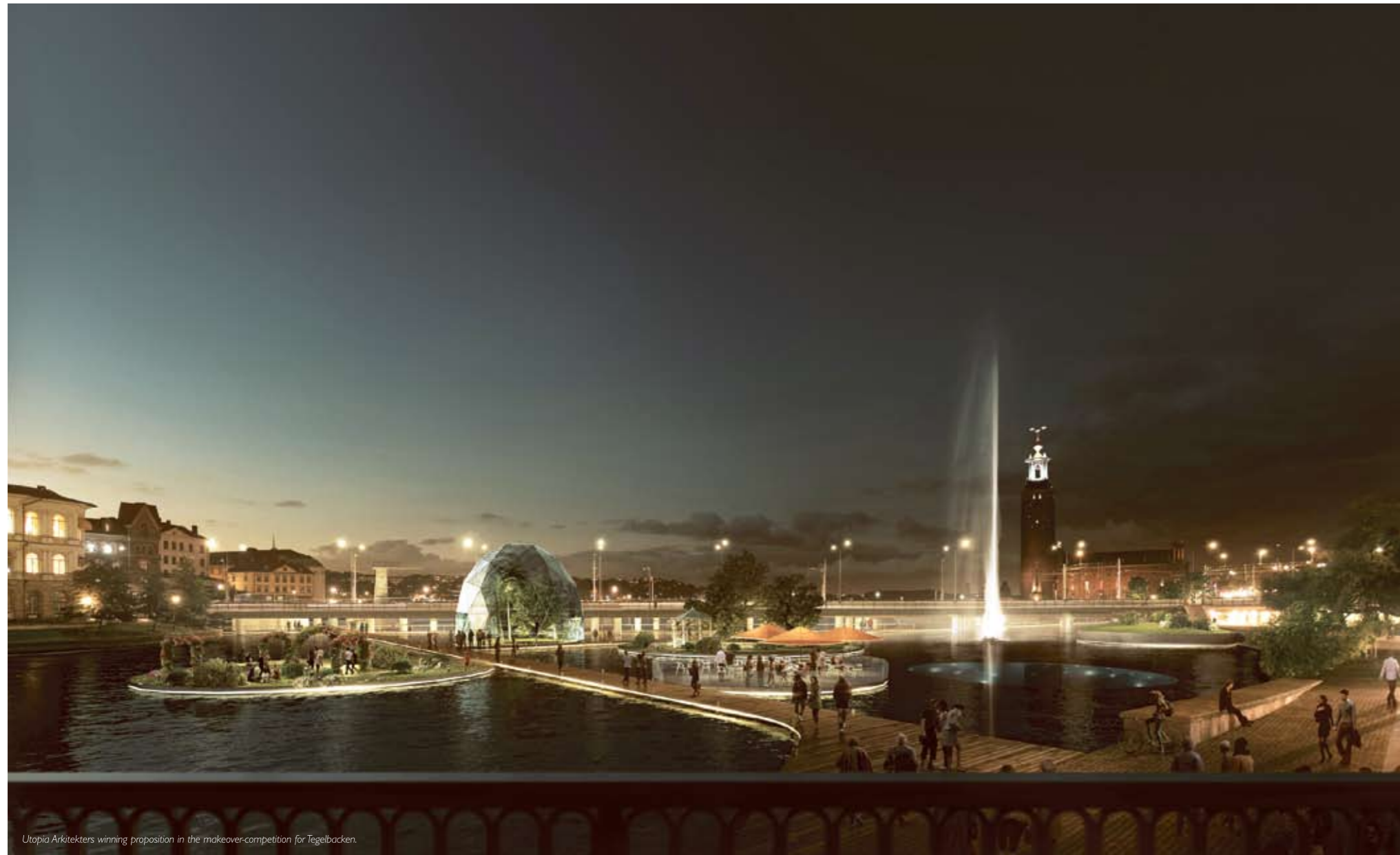
Utopia Arkitekter's winning proposition in the makeover-competition for Tegelbacken.